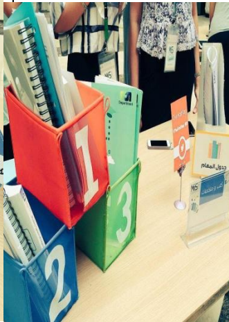
textbooks exchange corner